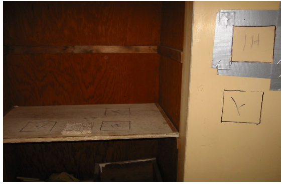
Figure 4: Marked wipe locations taken during controlled cooks.

As this table indicates, methamphetamine was not detected in any of the samples taken prior to conducting any of the cooks. The area was cleaned and sampled before any of the cooks and a 100 \text{ cm}^2 area marked off for each area. The areas were sampled before the cook and after the cook. Figure 4 shows a typical vertical surface marked for sampling.