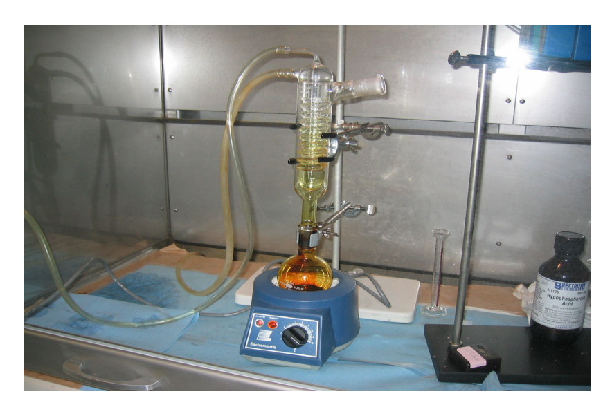
Figure 1: Iodine staining on condenser tube in laboratory hood.

The levels of iodine found in the air ranged from 2.3 \text{ mg/m}^3 to 37 \text{ mg/m}^3 during the actual cooks. The current TLV for iodine is a ceiling value of 1 \text{ mg/m}^3 indicating that the levels of iodine found in the controlled cook would have exceeded the current standards by almost an order of magnitude. This was not a surprise since the color of the gases coming off of the cook suggested that iodine was being released at high levels.