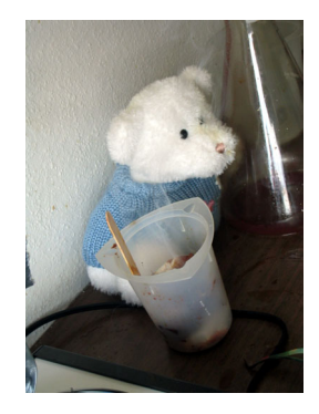
Figure 2: A teddy bear was placed in the methamphetamine lab

We also placed a stuffed bear approximately 12 inches from the cook area. After the cook was completed, the bear was sealed in a plastic bag and returned to the National Jewish laboratory. The pH of the bear was taken by pressing a piece of pH paper on the torso of the bear and then compared to the colorimetric chart. Results indicate that the bear had an extremely acid pH of 1.