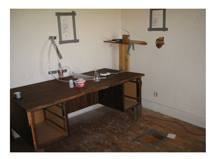
Figure 3: Methamphetamine lab setup in abandon house.

The building was set up to utilize cooking components that a clandestine cook would be expected to use. The amount of methamphetamine made was, however, less that the amount normally made by cooks, possibly resulting in lower exposure levels. A general cook set-up is shown below: