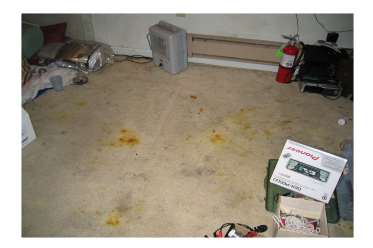
Figure 2: Iodine stains on carpet of suspected methamphetamine laboratory.

It was expected, therefore, that iodine exposures might be high in some of these facilities. The results of the sampling were as follows: